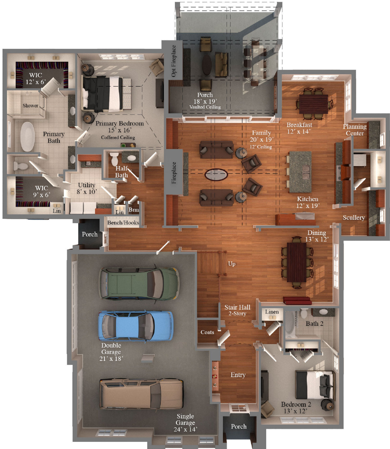
First Floor: 10' Ceilings unless noted