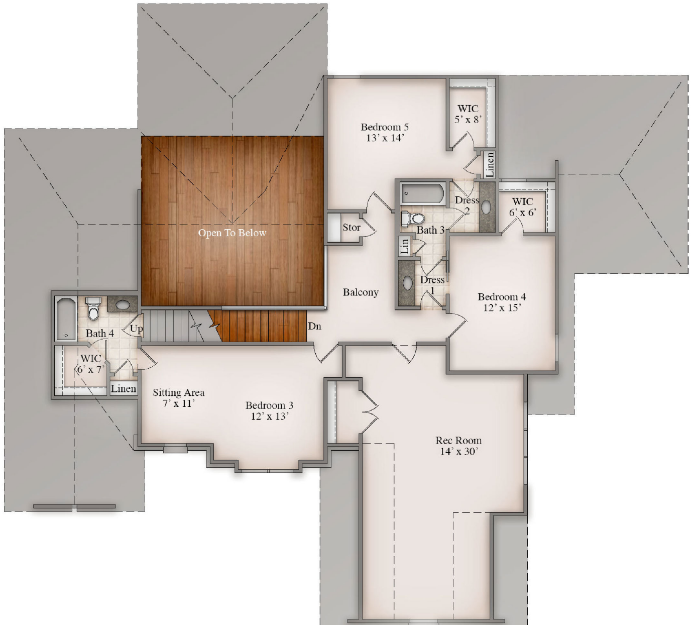
Second Floor: 9' Ceiling unless noted