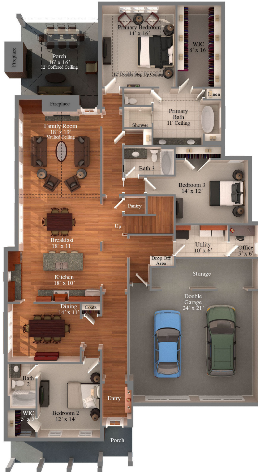
First Floor: 10' Ceilings unless noted