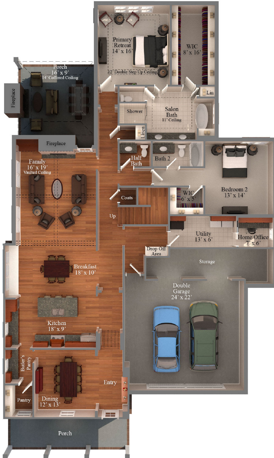
First Floor: 10' Ceilings unless noted