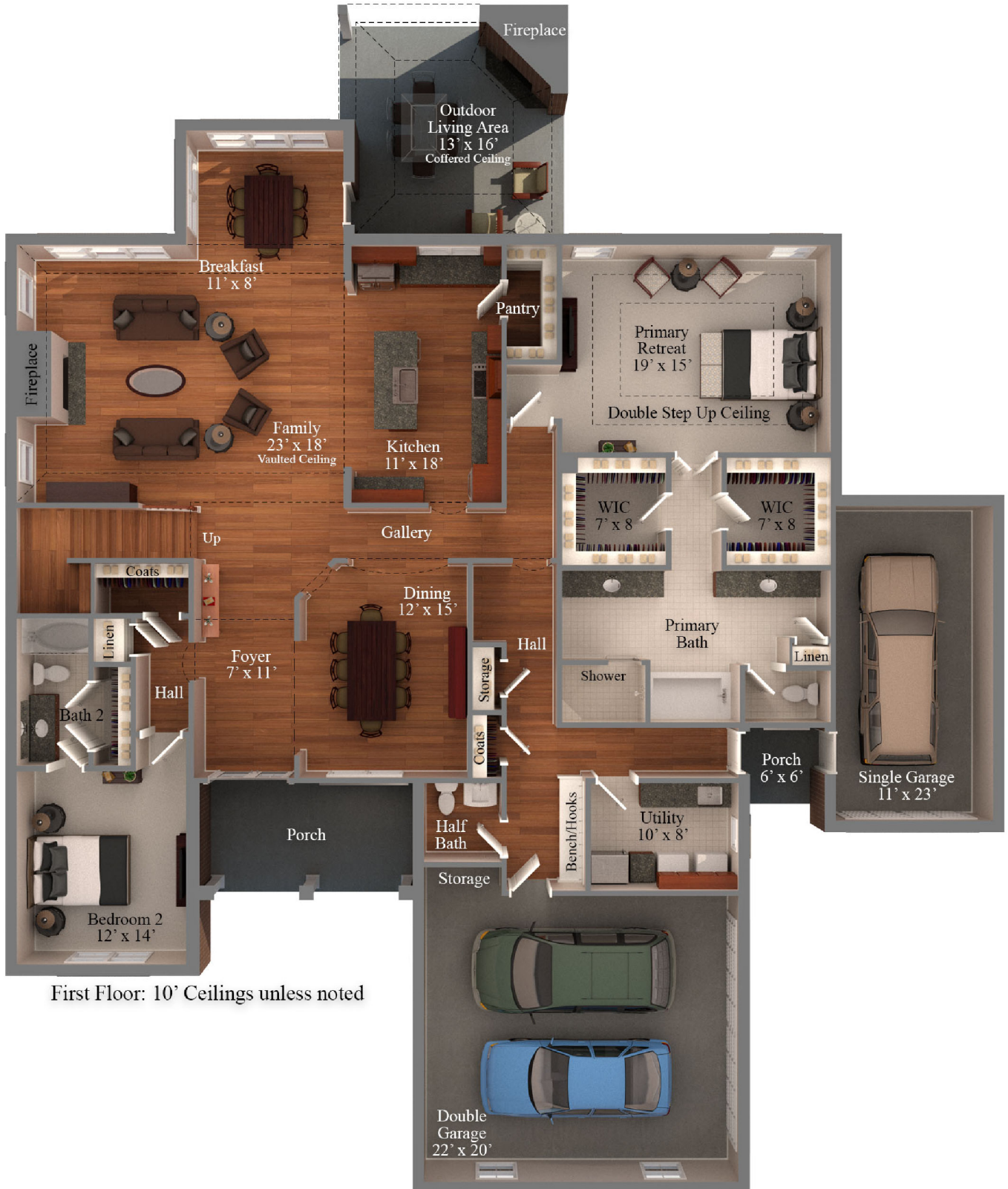
First Floor: 10' Ceilings unless noted