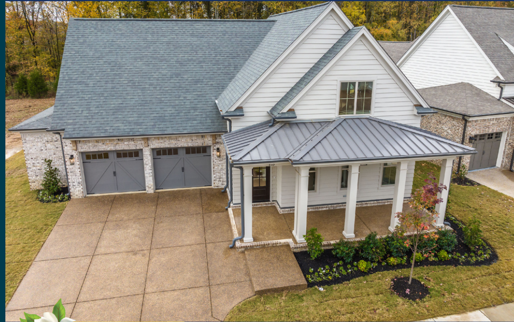
The Cove at Cypress

HOME SITE 211 893 CYPRESS VINE COVE COLLIERVILLE, TN 38017