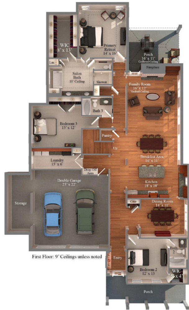
First Floor: 9' Ceilings unless noted