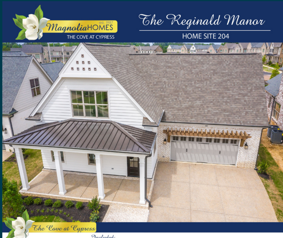
The Cove at Cypress

900 CYPRESS VINE COVE COLLIERVILLE, TN 38017