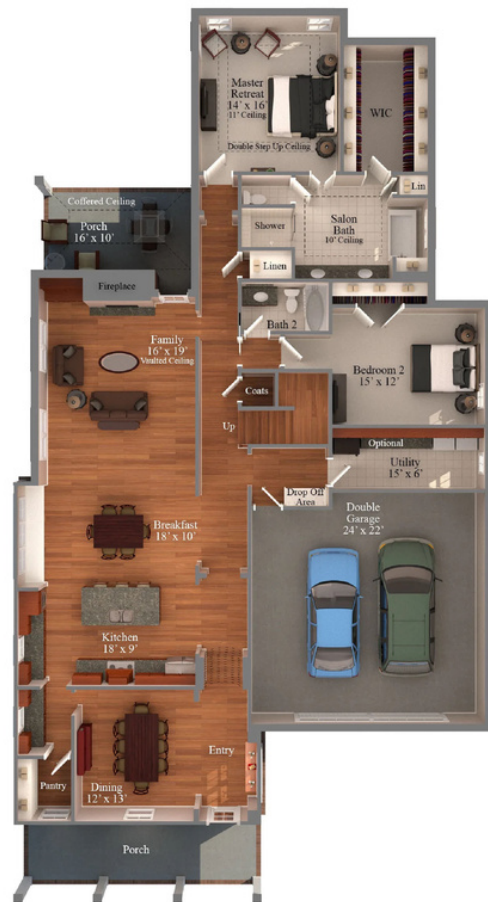
First Floor: 9' Ceilings unless noted

COPYRIGHT© MAGNOLIA HOMES, INC. ALL RIGHTS RESERVED. ALL PLANS MAY VARY AND PLANS CHANGE WITH EACH ELEVATION. 193 CARTWRIGHT FARM LANE | COLLIERVILLE, TN 38017 | APPOINTMENTS 901-309-0710 YOURMAGNOLIAHOME.COM | FIND US ON FACEBOOK! FACEBOOK.COM/MAGNOLIAHOMES