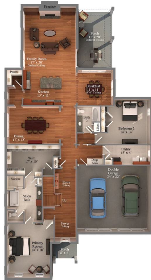
First Floor: 9' Ceilings unless noted