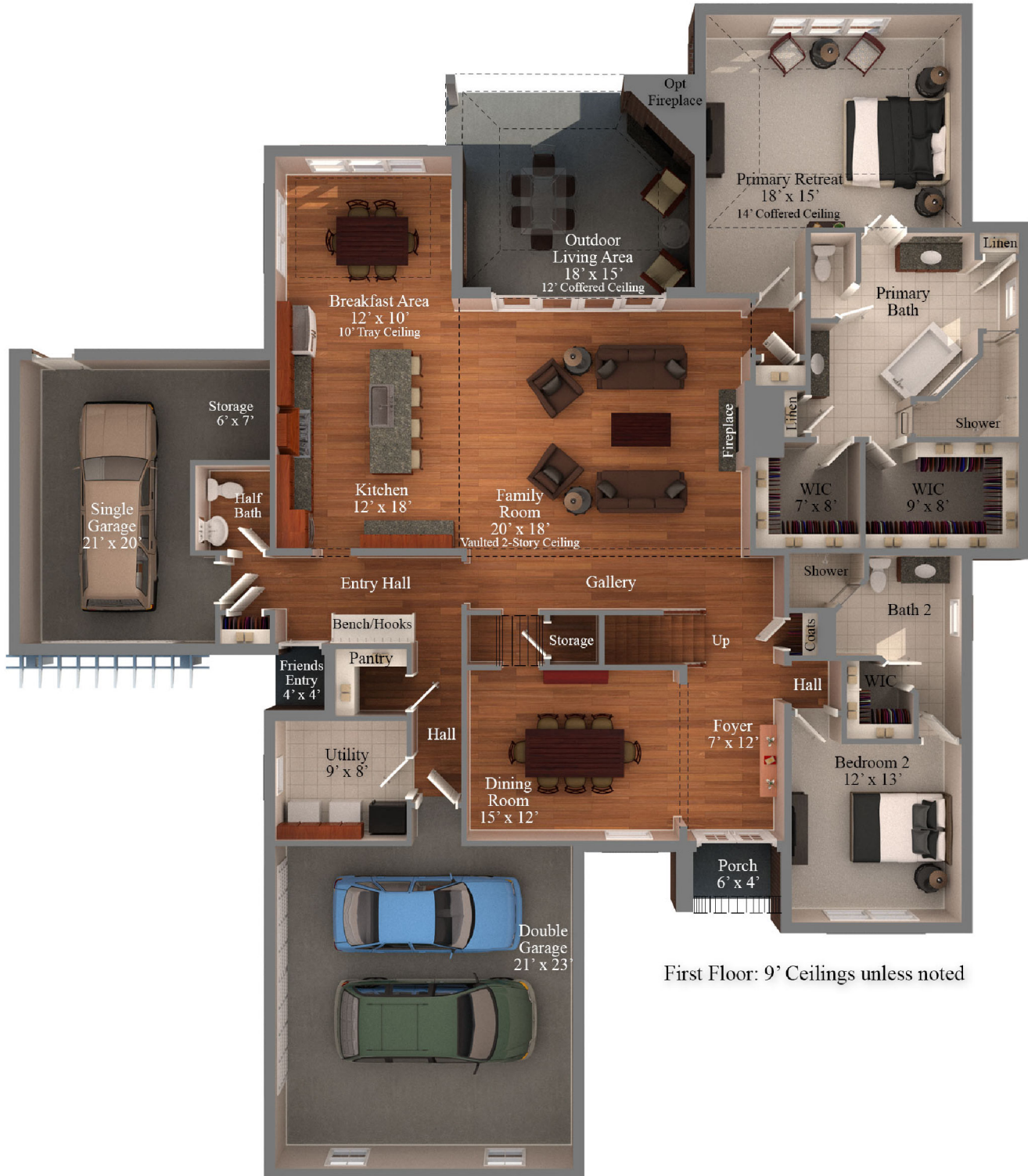
First Floor: 9' Ceilings unless noted