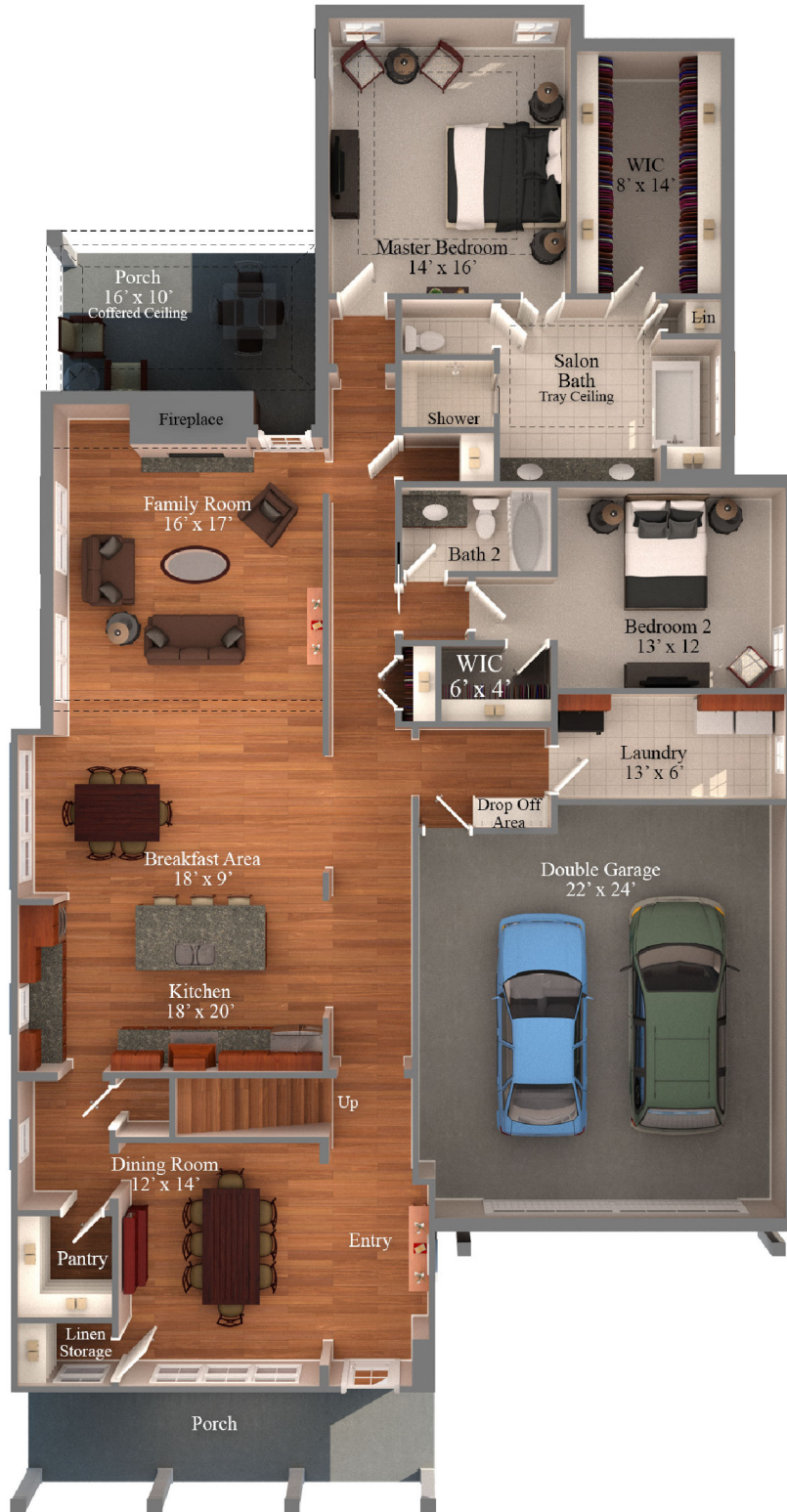
First Floor: 9' Ceilings unless noted